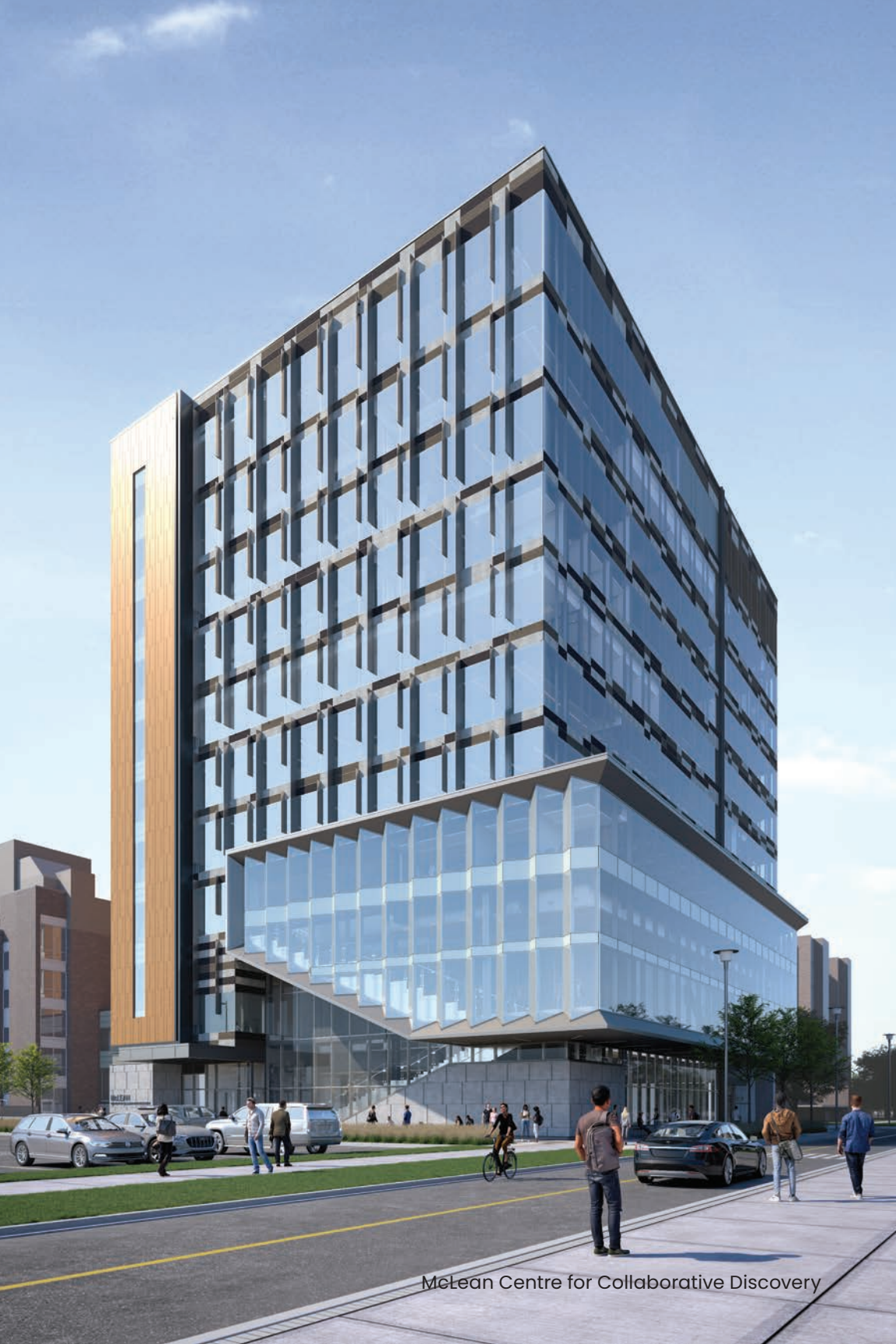
McLean Centre for Collaborative Discovery