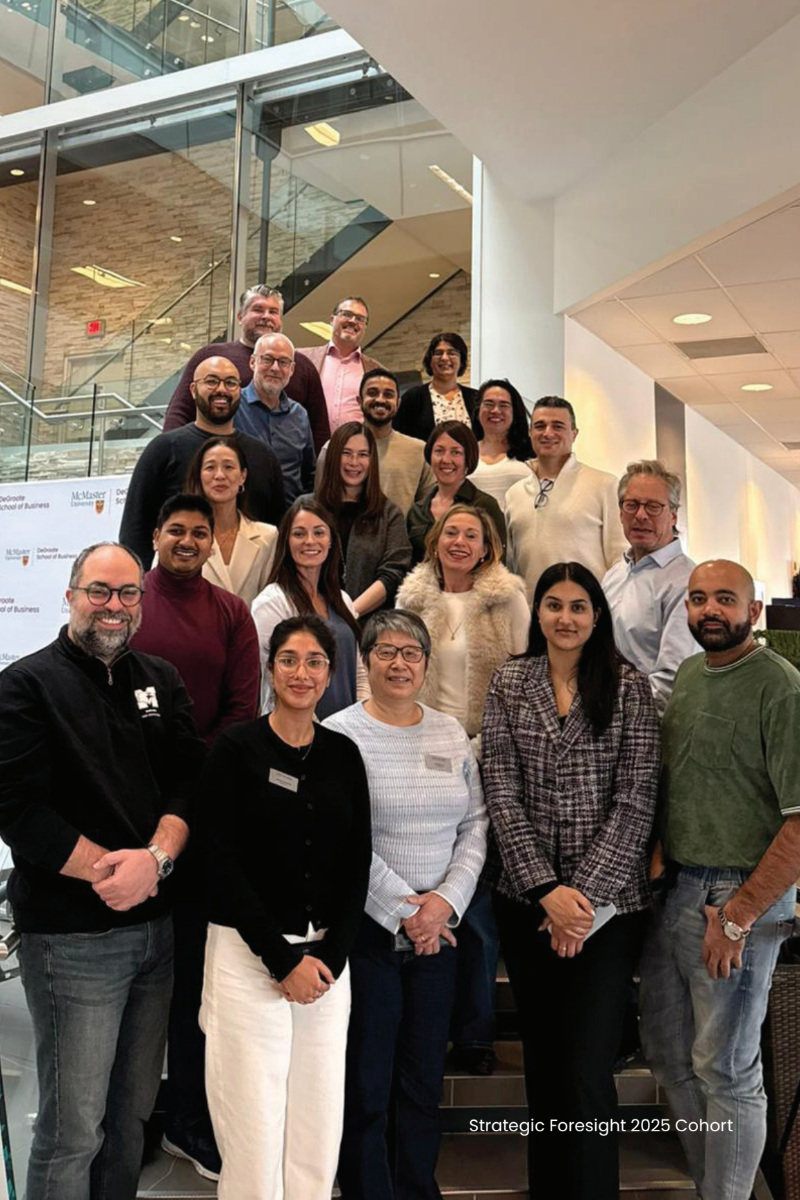
Strategic Foresight 2025 Cohort